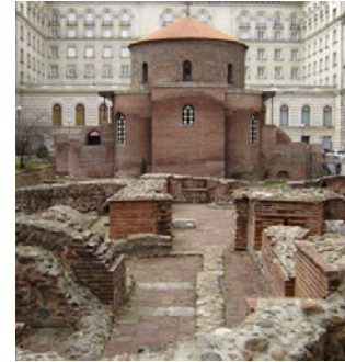
Medieval Church Saint George inside of the Presidency court