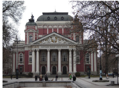
The National Theatre Ivan Vazov

Nowadays, Sofia still preserved the reminiscence of the civilizations past – Thracians, Romans, Slavs, Proto-Bulgarians, Byzantines, Turks, Jewish and Bulgarians left vestiges, interlaced in a composite urban stratification. The Resource Center quarter is extremely lively and is marked by “the street of the theatres” – G.S.Rakovski , the Slaveikov square – “the square of the books”, the French and the Czech Cultural Centers, the numerous bookstores.