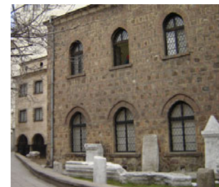
The Archaeological Museum in Sofia