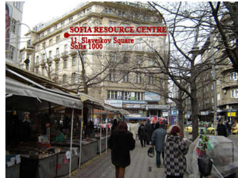
The building where the Resource Center is seated

The building housing the Branch Office of the European Institute of Cultural Routes in Sofia is situated on one of the Slaveikov square corners – a key location in the historical and cultural center of the capital.