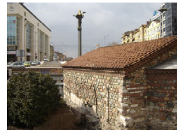
The Mediaeval Church St. Petka and the Statue of Sofia – protector of the town