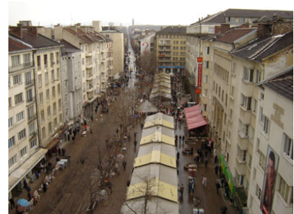
Slaveikov Square – view from the Resource Center terrace