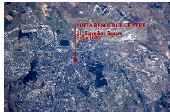
Sofia from air

The Sofia Resource Center of Cultural Routes of the Council of Europe is launched according to Conventions between the European Institute of Cultural Routes, ICOMOS/Bulgaria and the Association for Cultural Tourism signed on 21 June 2004 in Luxembourg. The Resource Center is a branch office of the European Institute of Cultural Routes and is seated in a governmental building in the Sofia historical center. The building houses also lots of publishing companies and the headquarters of the Bulgarian National Committee of ICOMOS.